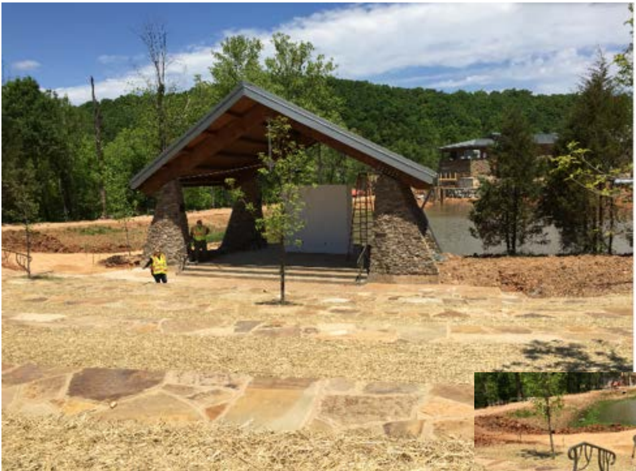
The amphitheater - Huge by state park standards, with a great view of the pond and lodge. Love the attention to detail...check out the fantastic handrails!