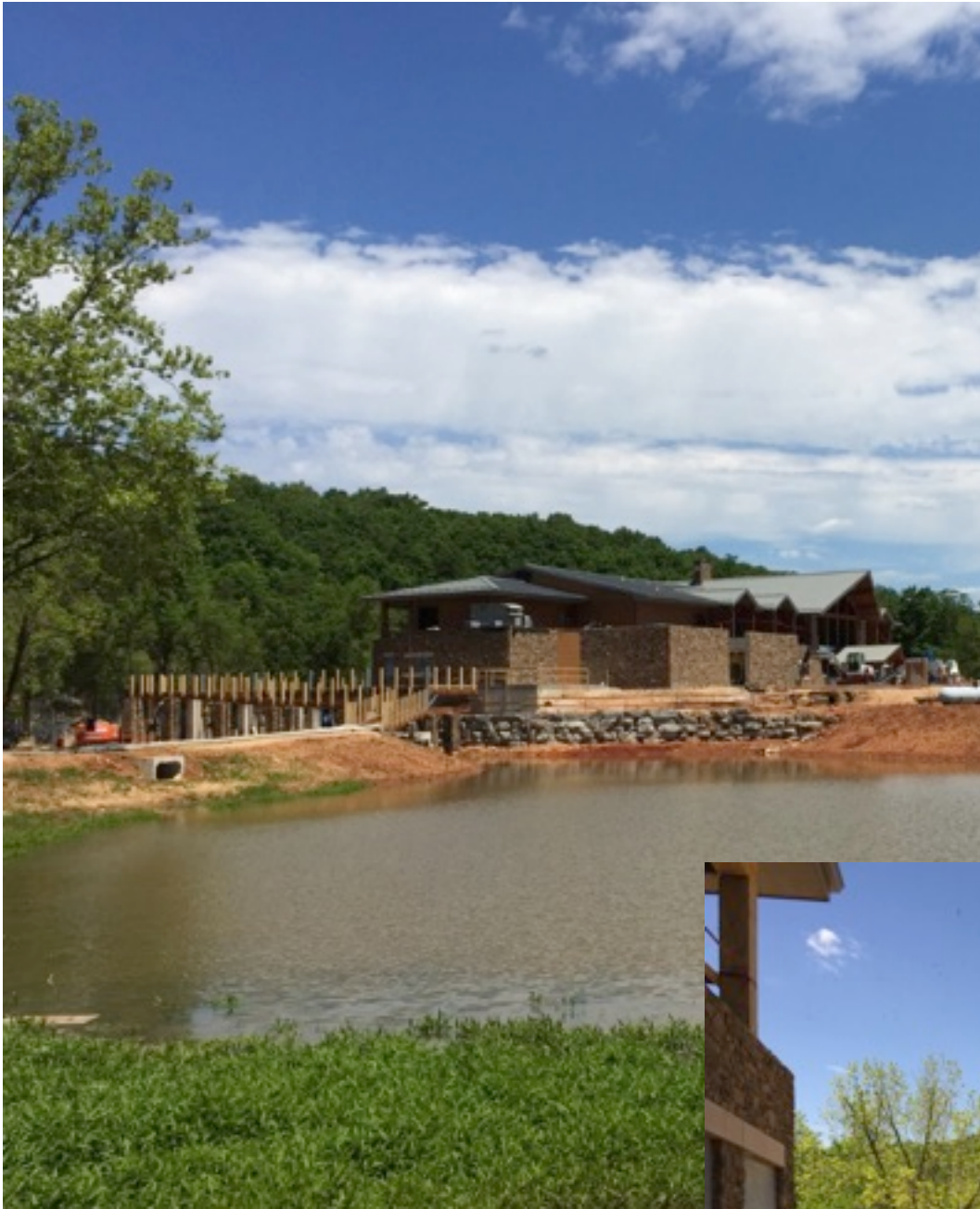
The front view of the new 'Lodge'