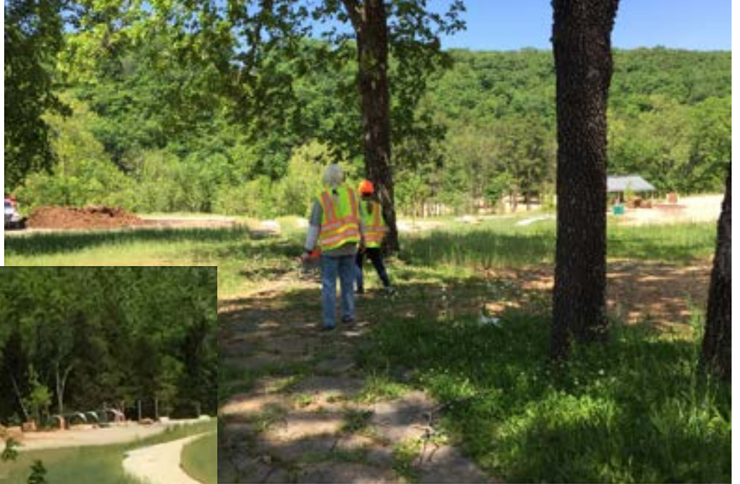
Walking down the original stone path

One of two new 'shelters'. Missouri State Parks wanted to use the names of the original Camp Zoe shelters...until they found out that they were simply called the "Old Shelter" and 'New Shelter'!